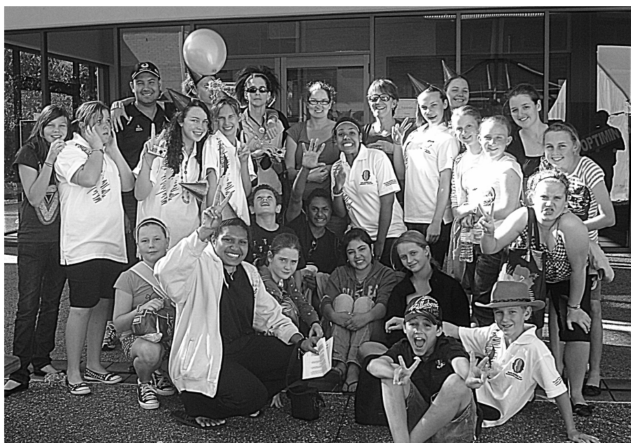
The Optiminds Group at the challenge in Cairns

The trip to the Challenge would not have been possible without the support and financial assistance of Riotinto Alcan, Weipa Campus P&C, Priority Country Area Program (PCAP), Goodline Fabrications and the College who contributed towards the cost of taking the students out to Cairns.