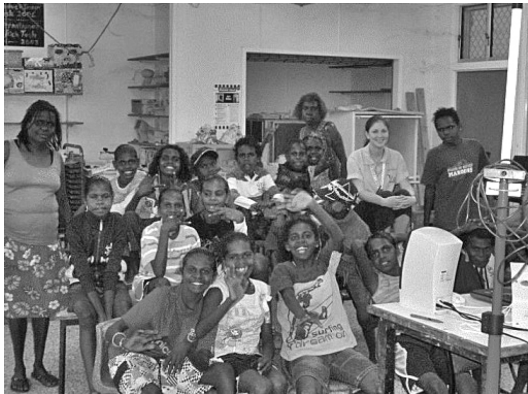
Year 6 and 6/7 Students from Aurukun participate in Technology Boot Camp