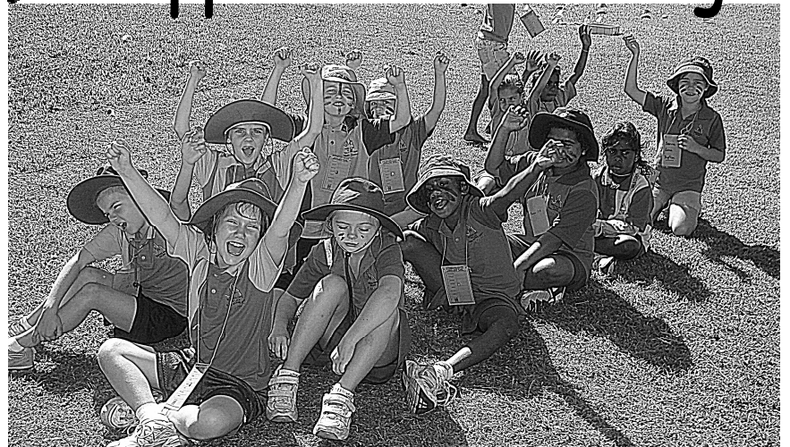
Western Cape College Primary School Students get in to the spirit at the Athletics Carnival