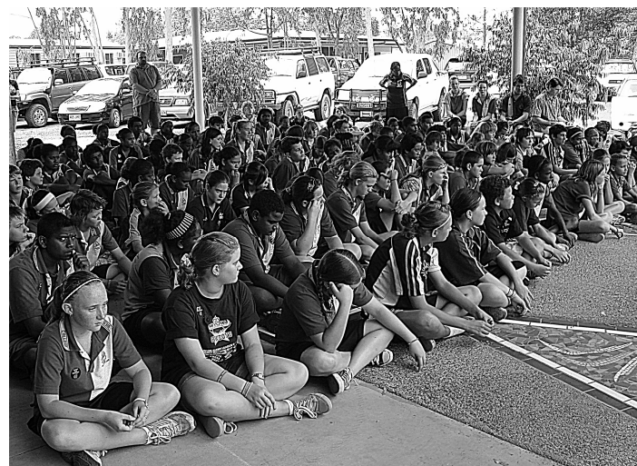
Weipa Campus Students stopped on the 11 of November to remembers the fallen soldiers during Remembrance Day