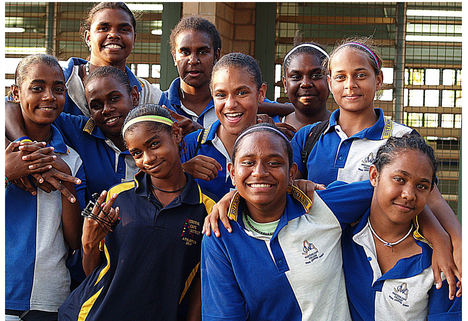
The Weipa Campus Rugby Girls at the Carnival in Cairns

Thanks to the Priority Country Area Program for contributing airfares, Weipa Autos for their sponsorship, and to the parents who supported their children in this sporting opportunity.