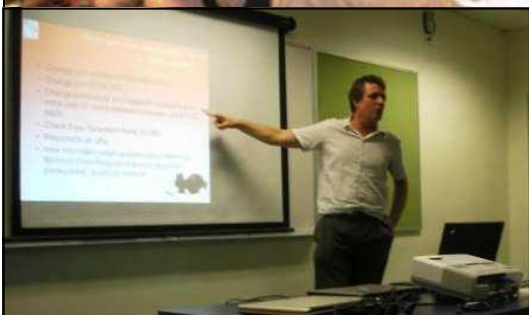
Parent Information Night