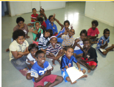
Year 4 and 4/5 ready for work

Year 4/5 has had a very exciting start to the year. Throughout the semester we have studied Australian Inventions and how they have changed over time. Everyone worked very hard when researching their inventions and many