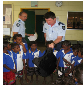
The students enjoyed looking at the police vest.

This term the Year 2 students have worked hard on becoming great puppeteers. They have made puppets from paper plates, paddle pop sticks and lots of other items.