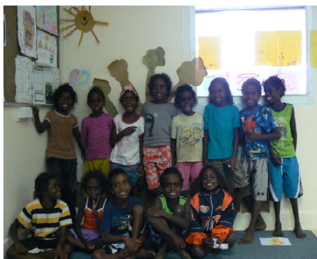
The class is standing in front our school family tree.