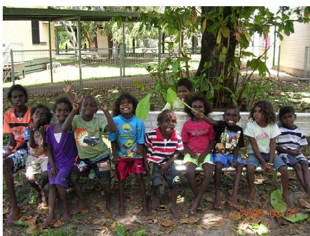
Year 1's learning their lines