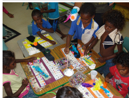
Year 2 working on their art projects