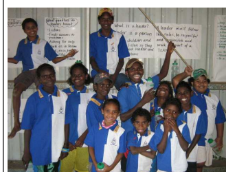
2008 Student Council at Leadership Day

The Rewards Room operates each day at 2nd break for those students making great choices in each year level.