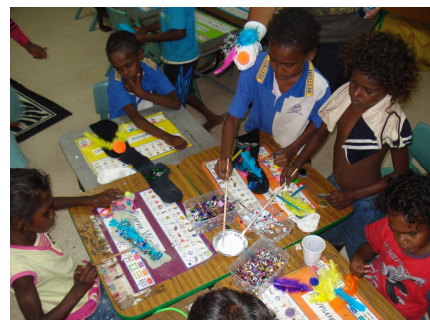
Year 2 using making sock puppets

This term Year 2 will be researching the animals of Aurukun. They will be investigating their lifecycles, environments and the movement of land, sea and air animals as well as producing a descriptive report. This unit of work requires the children to get amongst the animals and into their environment. A school excursion to the landing to take photos is on the agenda.