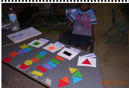
Percy sorting same and different shapes