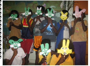
Can you guess which Year 4 students are behind these rabbit masks?