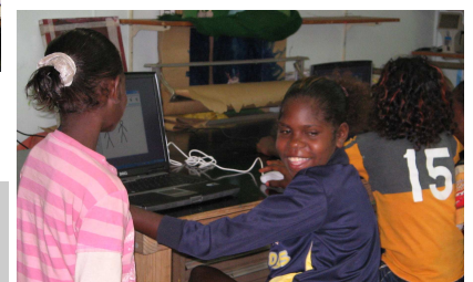
Year 6's using animation program.